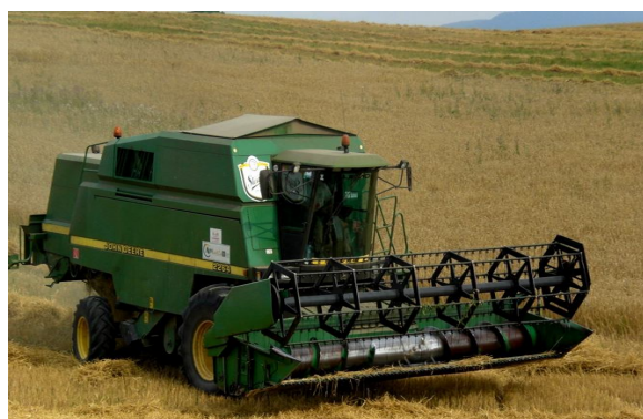
Fig. 1. John Deere 2264