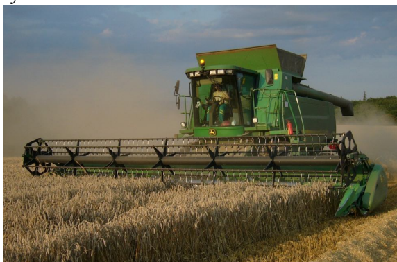
Fig. 1. John Deere 9780 CTS

Grain harvester John Deere 2264 or also called as the council "Z" is now not produced. We can say that this series did the distributors of brand good reputation in Slovakia. This is a relatively simple standard harvester with a single threshing drum and straw shakers with area 6.4 m 2 . Grain tank volume is 7,000 liters, 500 liters fuel tank and has a power of 250 hp. Like the CTS as well as here on the front axle is 800 mm wide tires, the company D-JD is considered to be a great advantage. The operator has sufficient comfort and ease of use, although the diagnostic equipment is the lower class and less user friendly than the CTS. Equipment that harvester contains the straw shredder and cutting table, ranging 6.1 meters which is colza adaptor brand Zürn with two side scythes.