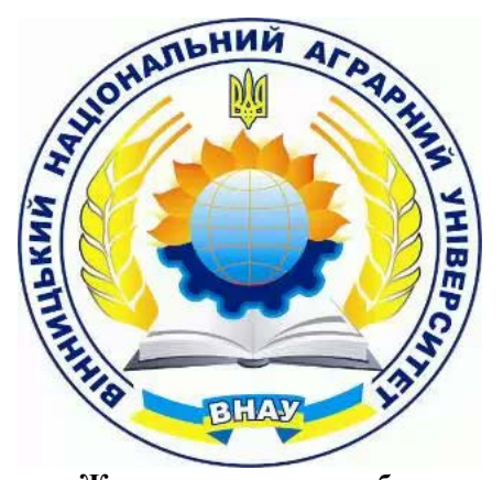
Журнал науково-виробничого та навчального спрямування