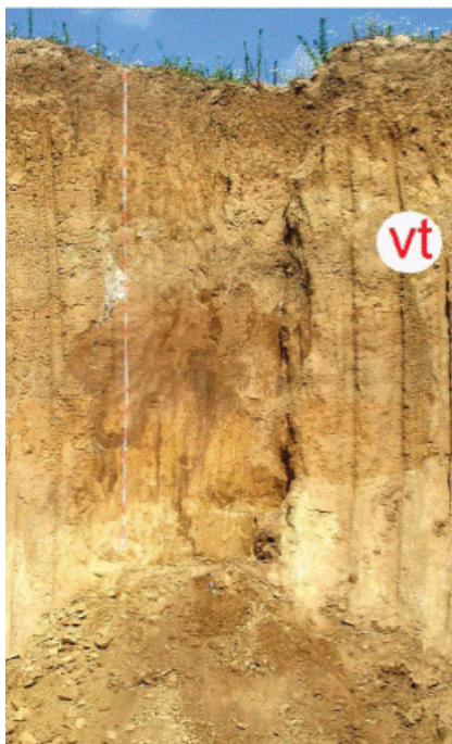
Figure 2. The Vitachiv horizon in a section of Pleistocene sediments (Yakushintsi village, Vinnytsia district, Vinnytsia region)