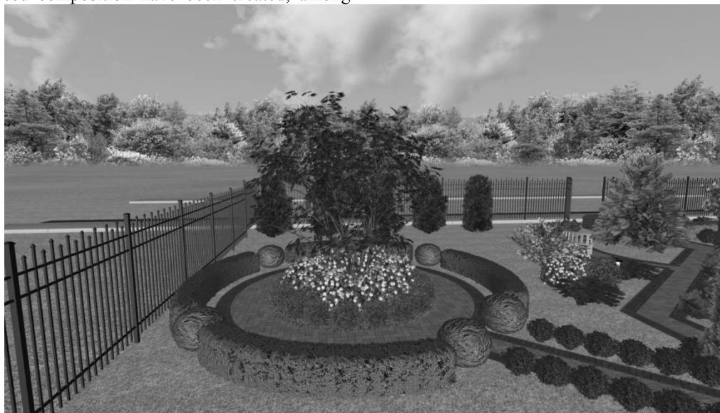
Fig. 3. Example of using a molding hedge

Assortment list of species used in landscaping, formed from eighteen species of trees and shrubs. Among them are Japanese maple, hanging birch, Lavalier hawthorn, and common oak form solitary plantings. A complete list of plants used in the design is presented in Table 1.