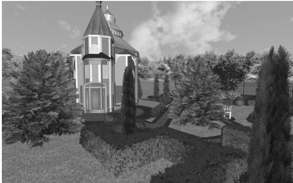
Fig. 2. The use of evergreen plants in the projected area

Against the background of the lawn formed group plantings, to increase the expressiveness of the composition used only highly ornamental species and varieties of woody and shrubby vegetation. Virgin magnolia will add charm and mystery to the object of landscaping in the spring, and boxwood evergreen and juniper horizontal will not lose its aesthetic appearance in the winter.