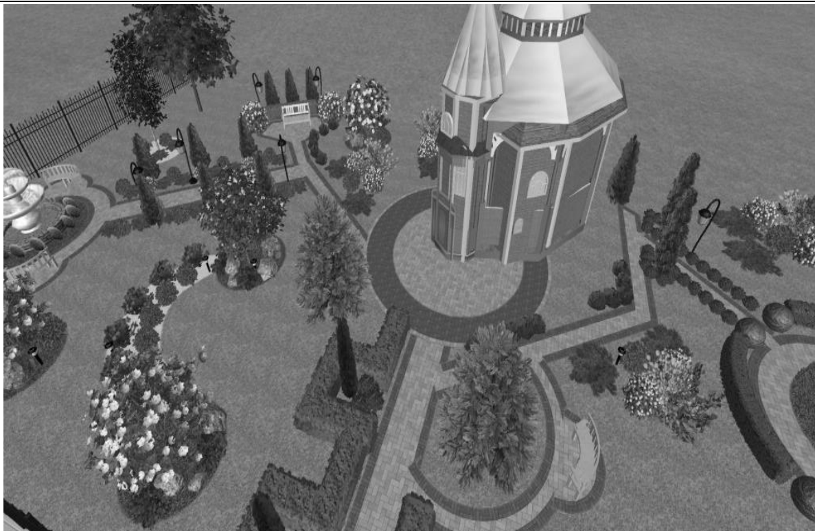
Fig. 5. Visualization of the dendroplan of the demonstration area in the park zone of VNAU

Table 2 shows the need for lawn grass seeds to create a normal garden lawn on the territory of the object