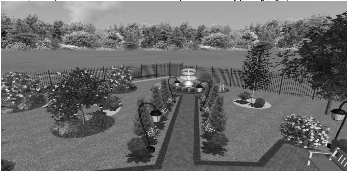
Fig. 1. Ordinary landing along the alley

Ordinary landing performs a utilitarian function, protects from noise, dust and absorbs harmful substances from the air. Trees with a pyramidal crown are planted in ordinary planting (Fig. 1).